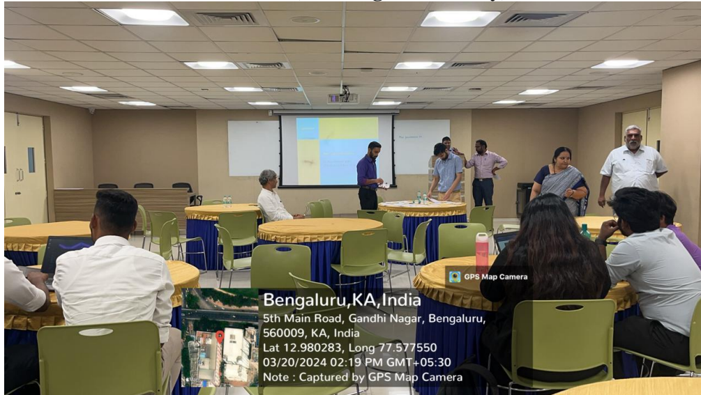
Figure 1 DS area faculties briefing about the game and preparing materials.