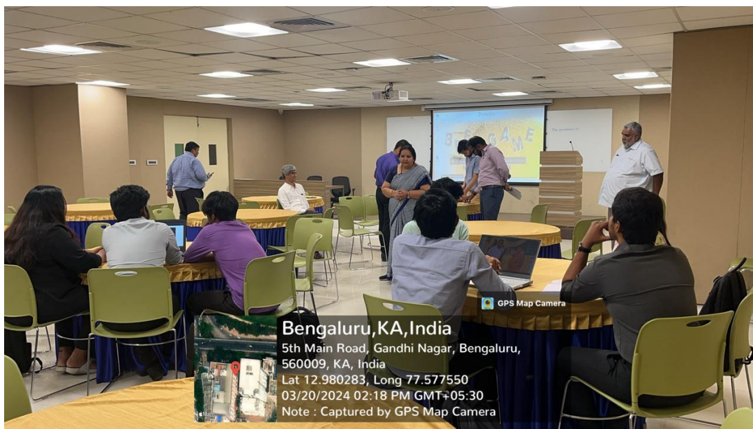
Figure 2 Students seated according to their role and Dr Vijaya addressing queries